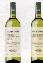
WINES TO TRY: Straden Sauvignon Blanc, 2018 Ried Silberberg Gelber Muskateller, 2017